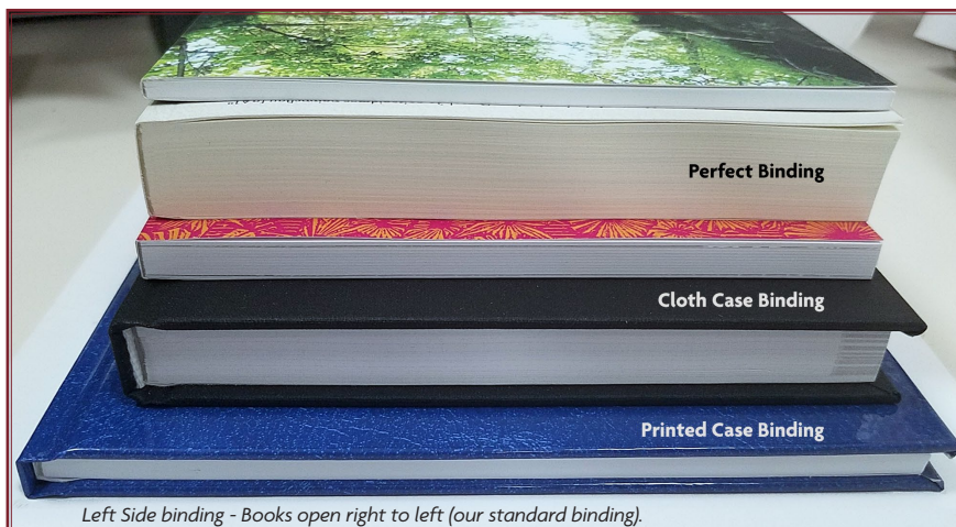
Left Side binding - Books open right to left (our standard binding).

Each hard cover is produced individually by our skilled employees. The finished hard cover and text book-blocks are then bound and glued together using either an unprinted 80# white or cream endsheets depending on your paper selection. We also offer the option for printed endsheets. Please contact us at Gasch if you have any additional questions about case binding.